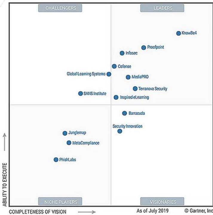
Figure 1. Magic Quadrant for Security Awareness Computer-Based Training

MSAT POWERED BY KnowBe4 | a specialist team using the market leading platform = proven results